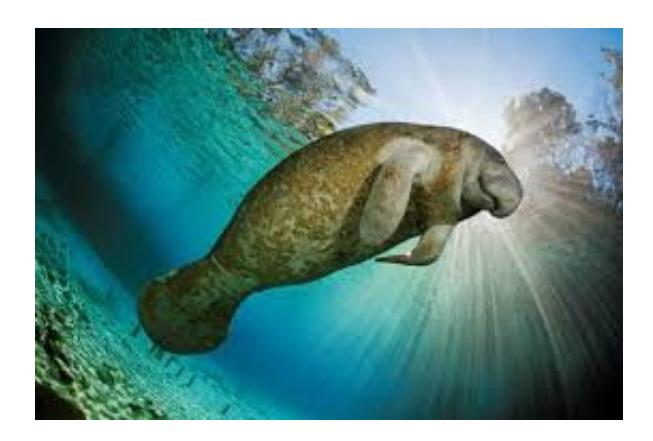
"Manatee"